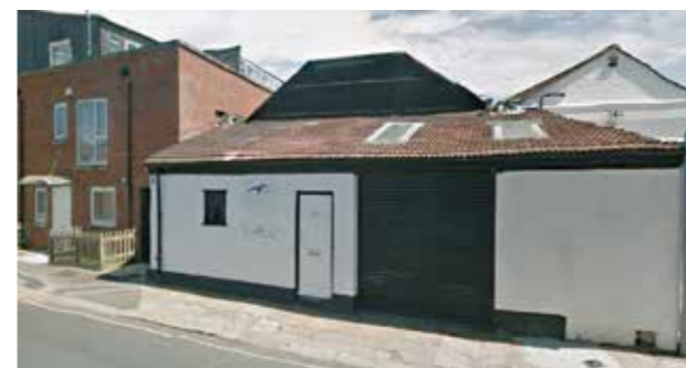
Haaya's Current Building

In 2013, after some intense negotiations and fundraising endeavours, HAAYA was thrilled to acquire a vacant, dilapidated warehouse at 41a Ivy Road, for the purposes of establishing a youth and community centre. With planning approval received in October 2015, the new, purpose built centre will be a spacious retreat for local young people to take part in exciting, regular educational and recreational activities.