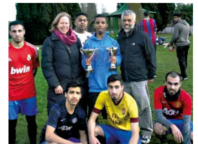
Rt Hon Ruth Cadbury MP with members of HAAYA squad

HAAYA is keen to support positive sporting activities that develop better understanding, cooperation and unity amongst members. As such, we are keen to develop new activities for Hounslow and its neighbouring areas to provide a safe recreational and sporting environment, for our users to be secure and healthy under our care.